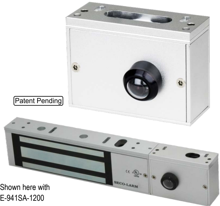
Shown here with E-941SA-1200