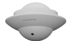
Flush-Mount Ball "UFO" Camera