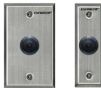
Discreet Wall-Plate Camera