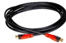
MC-1102 Series 9 Sizes available: 1.5ft~50ft