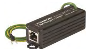
IPV-P188Q PoE Surge Protector