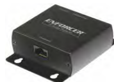
IPV-PD88Q IP Surge Protector