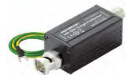
VS-1V22AQ HD-SDI Surge Protector