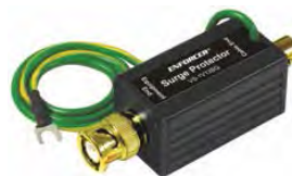
VS-1V12BQ Video Surge Protector