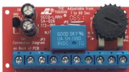
SA-026Q Miniature Timer Module