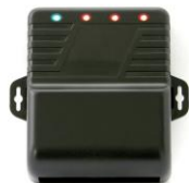
SA-025EQ Delayed Egress Timer