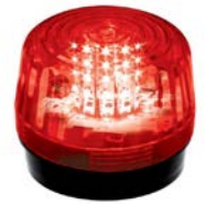
LED Strobe Light SL-1301-EAQ/R shown

Strobe lights available in Amber, Blue, Clear, Green and Red