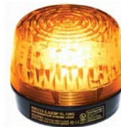
Xenon Tube Strobe Light SL-126Q/A shown