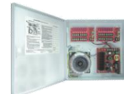
High-Amp DC Power Supply